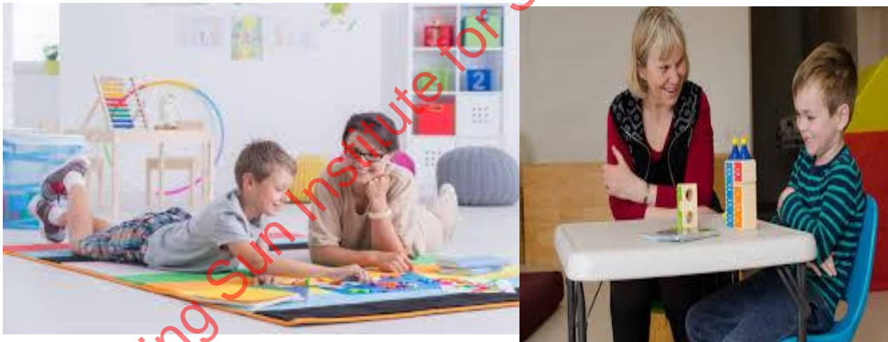
Table chair (Structure way) will be used. if not available or child will not sit on table chair. you can use mat or any sheet for floor sitting. You should minimize distracted things.

In start, child should sit with minimum time and with favorite object or toy. After some time eliminate favorite object or toy and focus on his/her goals. Gradually increase time.